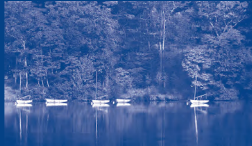
Boats on Lake Waban

from the deserts of Mexico and Africa to the rainforests of Malaysia and Brazil. The 15 greenhouses are open to the public, without charge, nearly every day of the year.