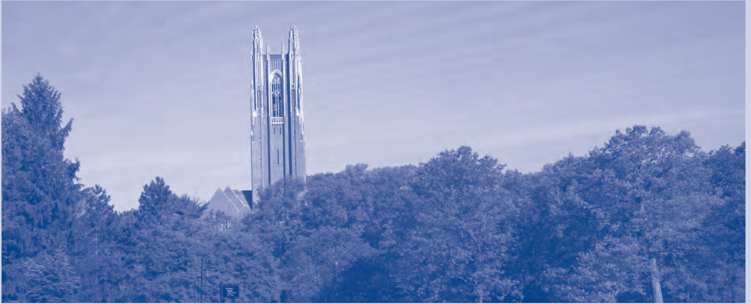
Wellesley College's Galen Stone Tower

Wellesley College and Babson College provide support for the Wellesley Community Children's Center (WCCC) , a private nonprofit organization located on land provided rent-free by the College. The WCCC serves 93 children, 35 of whom are Wellesley residents and 31 of whom have a parent employed by Wellesley College. The WCCC also provides after-school care to 280 children in the Wellesley Public Schools through its relationships with the school district and the Wellesley Public Library.