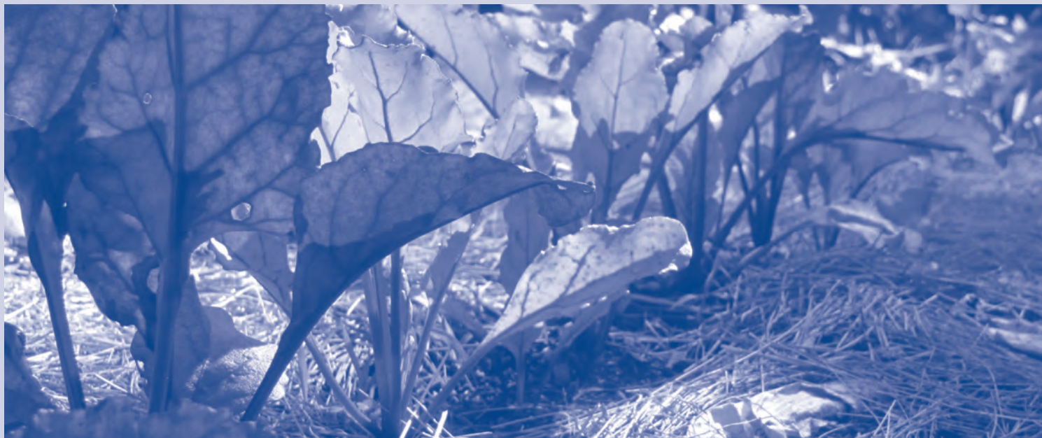
Wellesley's Organic Farming blog, source of this photo, was recognized as a top student food blog.

In 2008, the College set five-year institutional environmental goals for landscape, water, and energy use, as well as waste management. With one year remaining, the College is on track to meet most of its goals. Moreover, in the spring of 2012, the College supported the Town's effort to be designated the first EPA " Green Power Community " in Massachusetts by agreeing to purchase 5 percent of our electricity from the town's renewable energy sources.