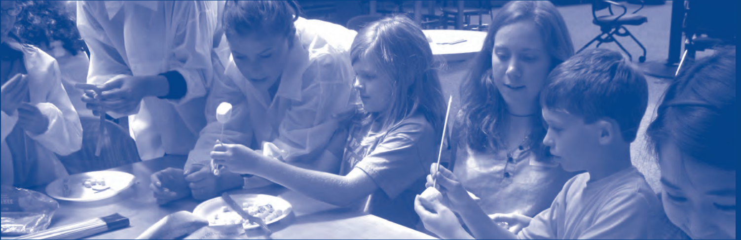
Wellesley students run the Young Scientist Neuroscience Lab, a free Saturday afternoon of science for 8- to 12-year-olds.

Wellesley College's commitment to service and civic engagement is embodied in our mission. The College's motto, Non Ministrari sed Ministrare (Not to Be Served, but to Serve), is well known—and lived—by students, faculty, and staff alike.